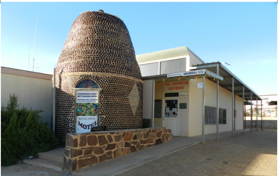
This months photo: The Bottlehouse stands at the entrance to the Andamooka Post Office incorporating Dukes Bottlehouse Motel and the Andamooka Underground Opal & Mineral Museum.

We hope that you are as excited as we are with this new sense of the old Andamooka fighting spirit towards putting our town well and truly back on the map.