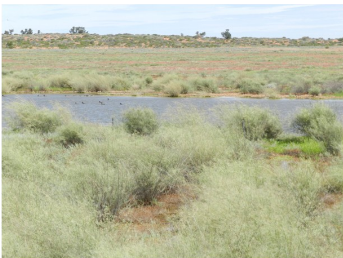
'Swan Lake' located just out of town on the Roxby Downs Rd, became a large and lush duck pond after summer rain events

The organising group is keen to work off the success of the day to continue this happy event into the future.