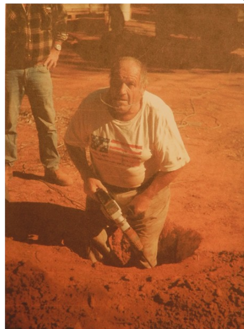
Digging for opal? A latrine?