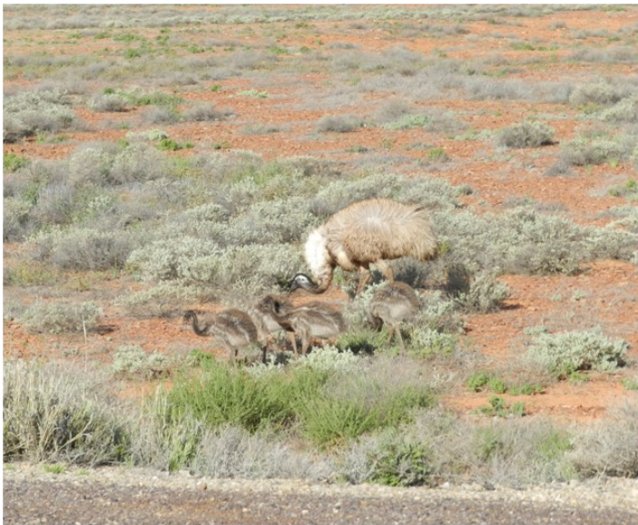
Our resident Emu family has successfully produced again....

Please add your support to the petition which will be forwarded to Government at the end of February.