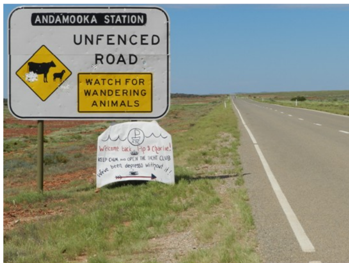
Welcome back, Pip and Charlie.... We are all very glad to have you back on board at the Yacht Club... Great Coffee again!!!!