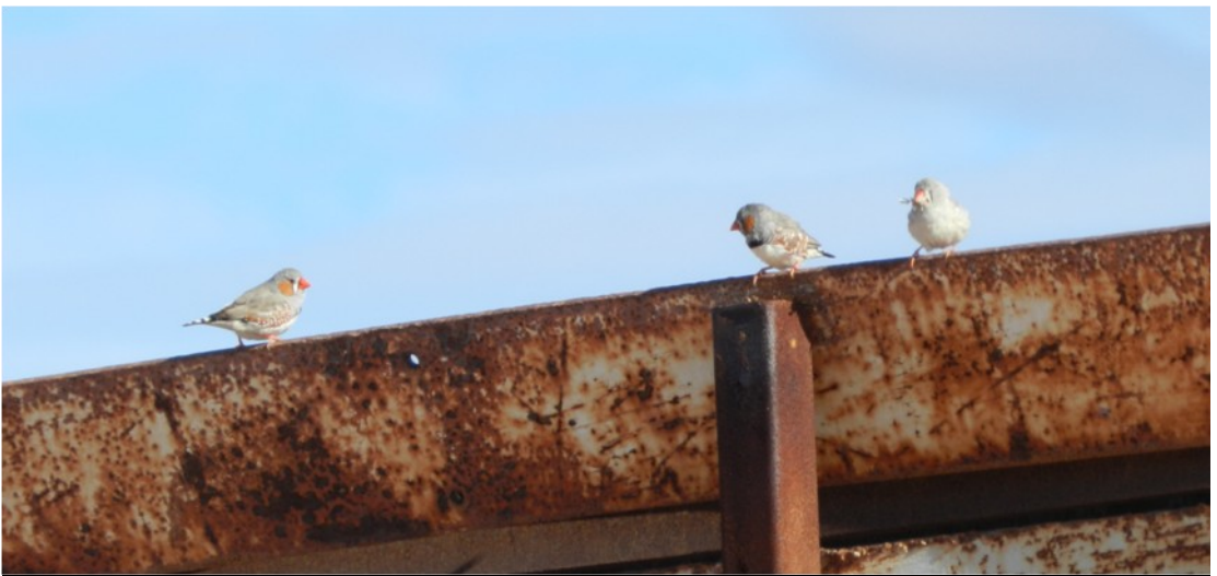
This months photo: Finches nesting in a noodling machine located on an opal mining claim in Andamooka. Many of our local miners have various wildlife living alongside their workings.

We urge you to take the time to attend the next forum, and to help make Andamooka a great place to live and to visit.