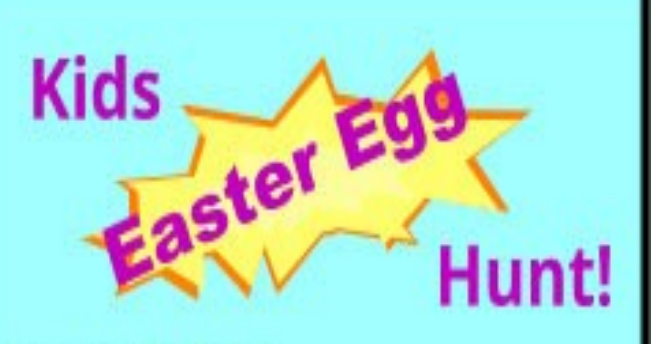
Sunday 31" March Starts 9am at the The Cottages

A casual brain-teasing fun night for all egg-heads