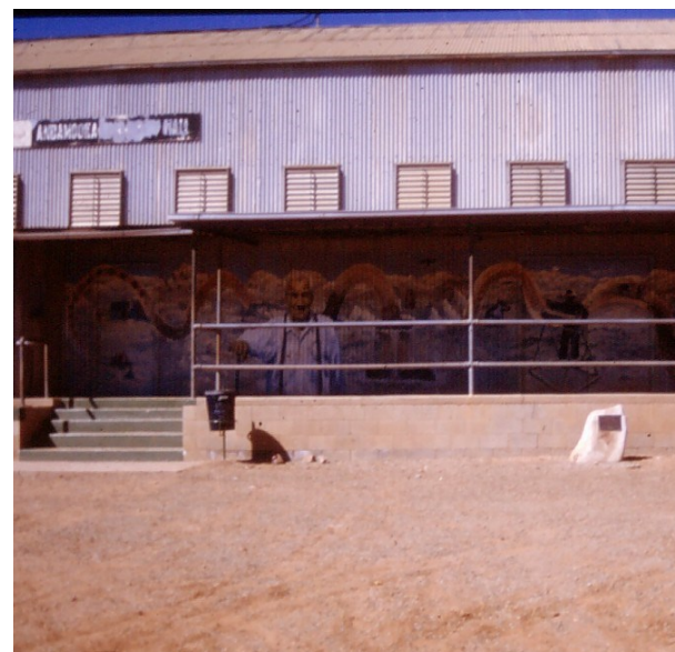
The way it was. Community Hall circa 2005