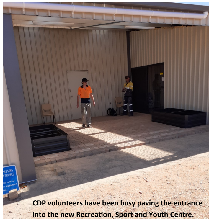
CDP volunteers have been busy paving the entrance into the new Recreation, Sport and Youth Centre.

There is a myriad of needs, from sports coaching to workshops for all ages and stages, so if you are interested in getting involved, there will be training opportunities and assistance with costs and apparel, so please don't hesitate to drop in and have a chat about how you would like to get involved, or about an idea that you might have.