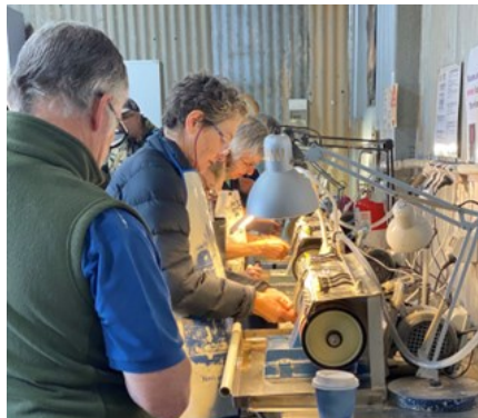
Polishing opal at the Lapidary Workshop