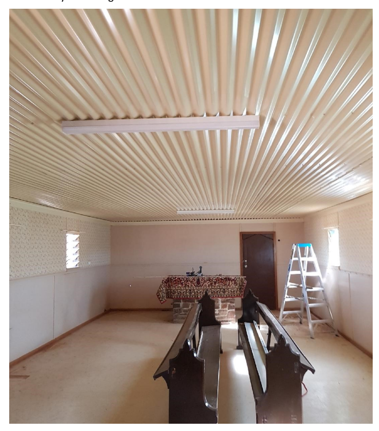
New ceiling and lighting has been installed.

The upgrade project is looking towards completion in early spring subject to further delays from Covid19 lock-downs which has recently delayed delivery of the sliding door and other materials. In turn this delays progress with setting up the community shop in the hall. We are all looking forward to seeing 'the church' not only up and running, but also once again meeting needs within the broad community and assisting with community wellbeing.