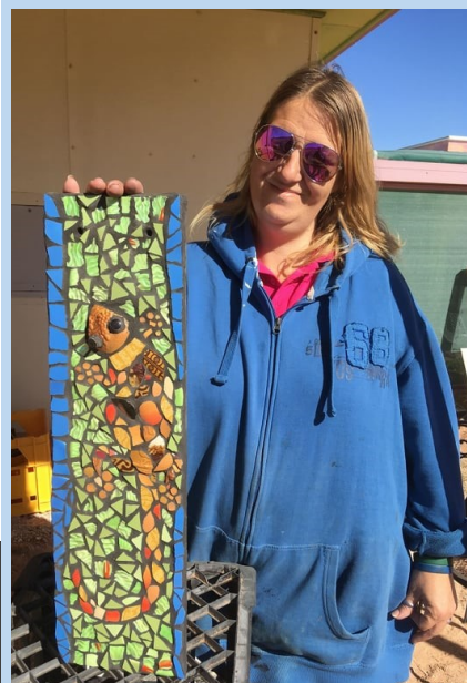
“Grouting’s messy. So I’m wearing my old clothes. I am quite grubby and absolutely exhausted. The “haze” has just starting on the crockery and I still have to get that haze polished off.”

up the crockery – wheeled nippers, safety glasses. The volunteers at the CWA Shop are really good to me. They save the odd pieces of crockery for me as well as any accidental breakages. They know I can use the pieces. Sometimes I spend hours at night cutting up crockery into small pieces. I find it very relaxing. I like to have a good stash of crockery bits before I start gluing the bits to the microwave plate.