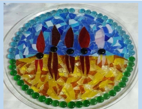
Above: "90th Birthday Sturt Desert Peas". By Trish Curnow using glass and gems on a microwave plate.