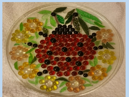
Above: "Ladybird" by Trish Curnow using glass and gems on a microwave plate.