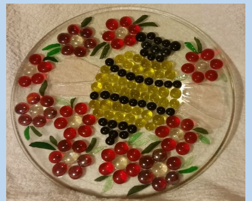
Above: "Bee" by Trish Curnow using glass and gems on a microwave plate.