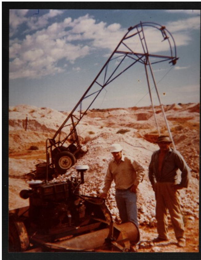
This bucket loading machine is typical of those used by many miners on the Andamooka and surrounding fields.

Drop into the Andamooka Post Office for more information on the Stuart Creek opal field and they will also assist with information on the condition of the track. You will also be able to get a wealth of information about what to do and see on the way there and back and sound advice to assist your trip.