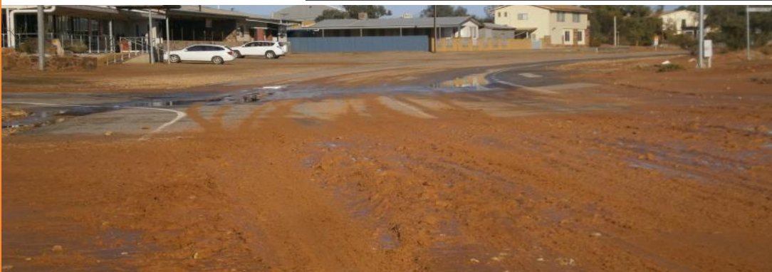
Photo: The aftermath of Novembers wet'n'wild weather.