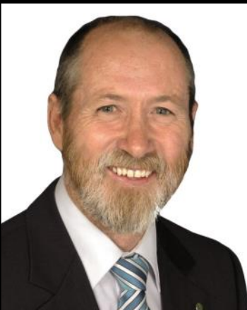
Rowan Ramsey MP

Ring my office for an appointment next time I am in ANDAMOOKA