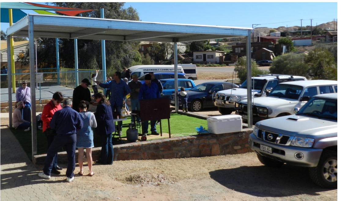
This months photo: The new undercover recreation space at the Hall was put to use at the Volunteers Day, Family fun day on Monday 12 June with volunteers hard at work keeping up with demand. Photo: G Rowley 2017

Header photo: Sun rising over mullocks, White Dam Photo: G Rowley 2017