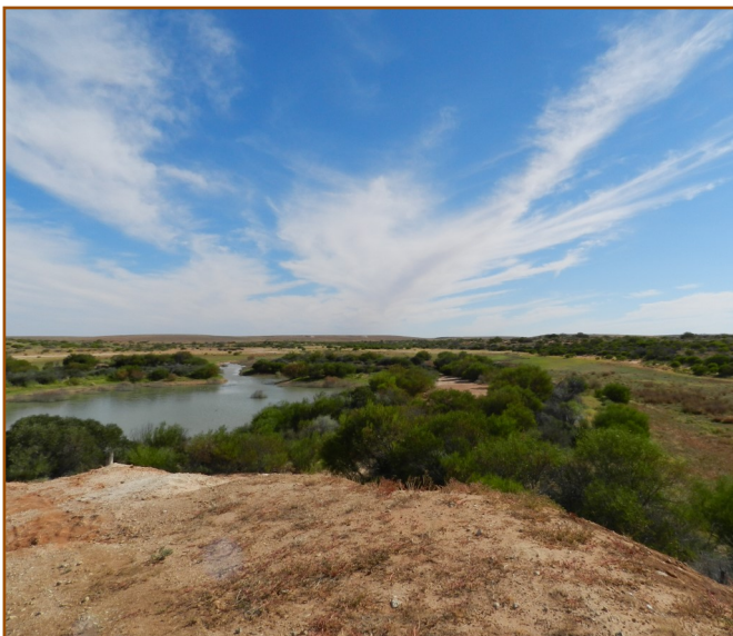
Swamp Dam: Nestled in a brown landscape, you'll find this green oasis on the way to the old airstrip.