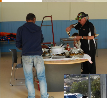
Volunteers tucking into lunch