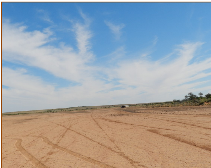
Old Airstrip: 20 minutes by 4WD out of town. Located on the edge of a clay pan, the original hanger used to see many private charters fly in. Perfect for lunch or dinner around a camp fire.