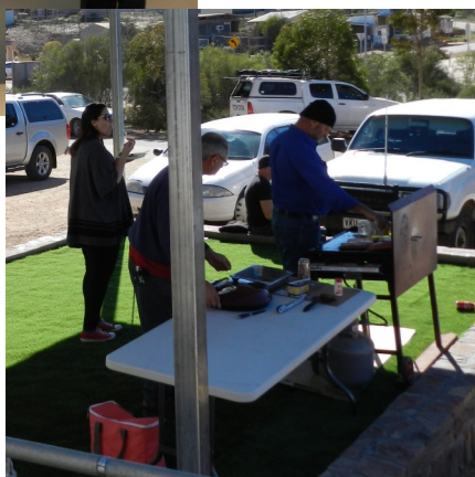
Volunteers cooking up the Volunteers BBQ lunch— just the way it is in Andamooka!