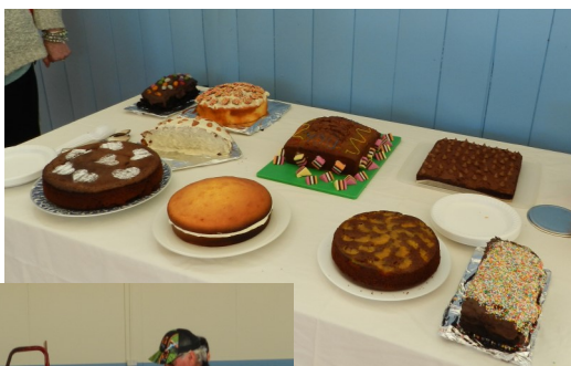
Cake for all to share...

Once the morning activities died down, around 25 of our local volunteers joined locals and members of the APOMA committee for a 'thank you lunch' followed by a cake cutting celebration recognising the mix of volunteers from all the various cultural backgrounds that have built our town from the red dust upwards and who keep it vibrant and functioning today.