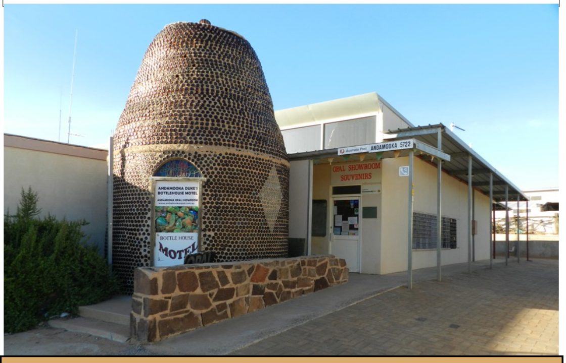
This months photo: The Bottlehouse stands at the entrance to the Andamooka Post Office incorporating Dukes Bottlehouse Motel and the Andamooka Underground Opal & Mineral Museum.

We hope that you are as excited as we are with this new sense of the old Andamooka fighting spirit towards putting our town well and truly back on the map.