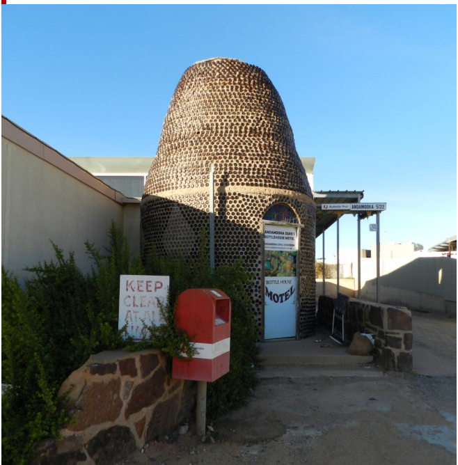
The iconic Bottlehouse stands today as a welcoming sentinel at the entrance to the facility.

Bucket showers (tread up your own water), hard water, generators off at 11pm, hot nights, cold nights, flies & dust, kerosene fridges that didn't always keep the beer cold, were all part and parcel of that wealth of wonderment that is the lure of the Outback. And if the rain kept you here but the food supplies out, well all the better!! The hospitality shown by the unique array of local identities would always keep one bemused.