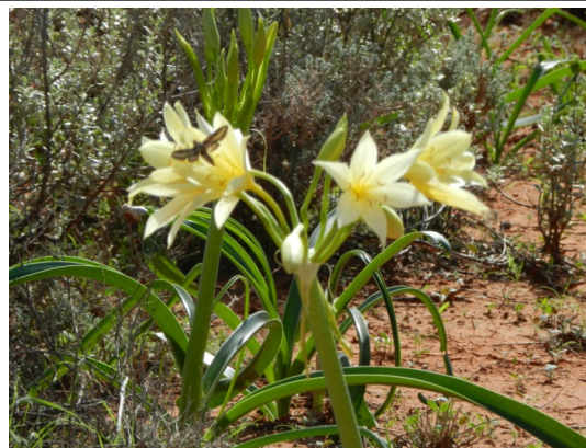
A native moth visits an Andamooka Lily which is unique to the region. They look beautiful but smell dreadful.

Dams and gilgais are brimming. Their waters clearly reflect the brilliance of the azure blue sky, their surrounds and visiting water birds, creating masterpieces across the surface which are a photographers delight.