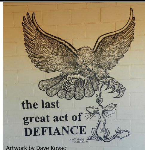
Artwork by Dave Kovac

From driving the community bus or medical vehicles, to cleaning up the town, preserving our historic collection, sweating over BBQs & setting