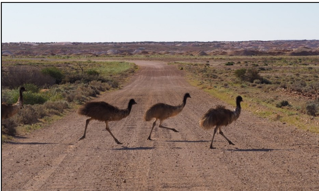
This months photo: Our Andamooka family is growing up but with no road sense.

VOLUNTEERS DAY—13 JUNE, WE SALUTE OUR ANDAMOOKA VOLUNTEERS!