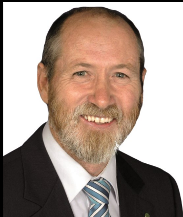
Rowan Ramsey MP

Ring my office for an appointment next time I am in ANDAMOOKA