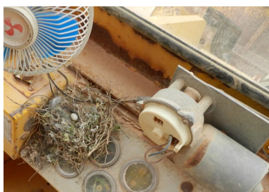
Room with a view! Nest built in a loader cab.