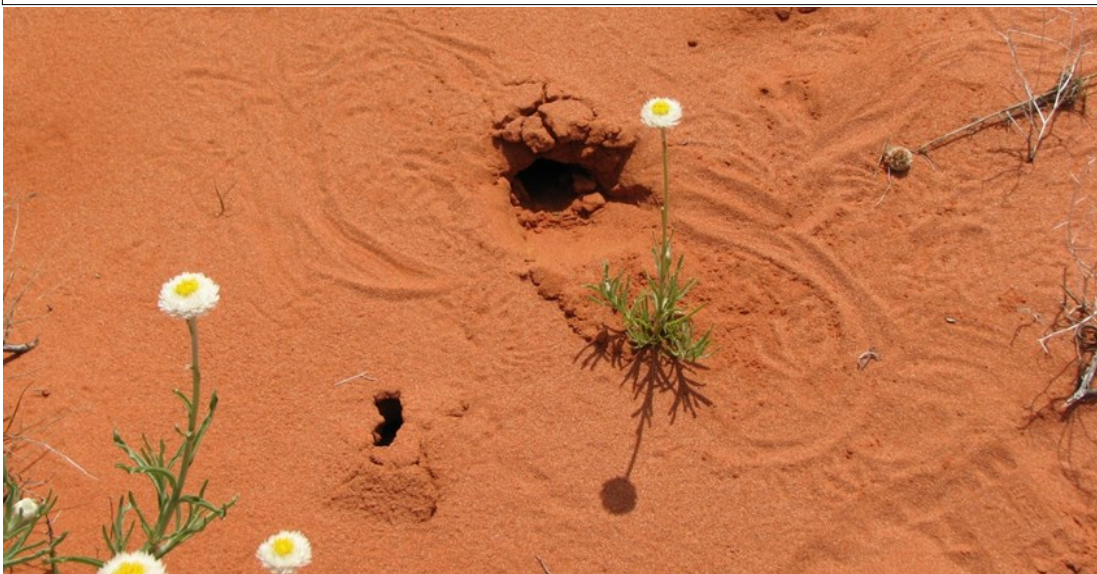
This months photo: Lizard diggings and tracks tell a tale in the sand dunes.