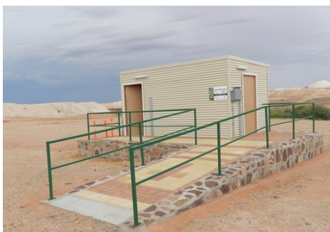
The newly completed wheelchair ramp which will be protected under the new tropical roof to be built over the structure.

The new structure will complement the existing tropical roof over the BBQ area which was constructed ahead of the 2014-15 tourist season.