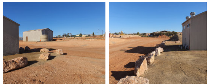
Above: Ground work at the community recreation centre.