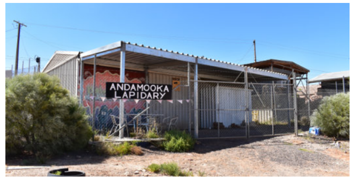
Above: Lapidary shed veranda.