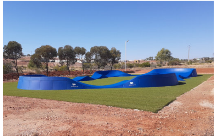
Above: Completed Pump Track.

We would like to thank our volunteers both local & traveling for their assistance.